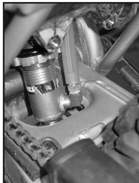
Fig.2 Hose exits to the right rear. After Aug. 1, 2003 all XR shocks were produced with a threaded body with a flush mount. Earlier welded shock is shown.