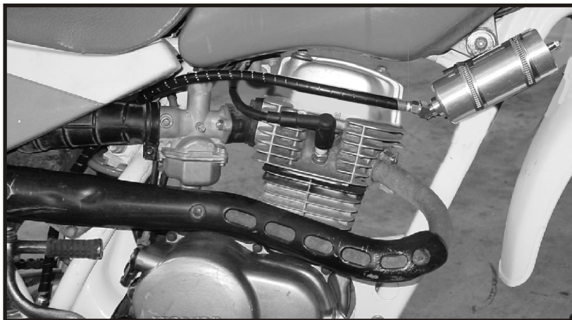
Fig.1 Hose goes up to the left of the carburetor intake boot and to the right of the carb top. The hose should make a smooth arc. Early model shown. Bracket is attached to tank mount. Do not zip tie, wire or clamp the hose to any part of the motorcycle, as the hose should be allowed to move up and down as the suspension moves.

CAUTION: DO NOT ZIP TIE, WIRE OR CLAMP THE HOSE TO ANY PART OF THE FRAME, AIR BOX OR OTHER PART OF THE MOTORCYCLE. SINCE THE SHOCK MOVES WITH THE SWINGARM, THE HOSE MOVES UP TOO, AND SHOULD BE ALLOWED TO MOVE FREELY.