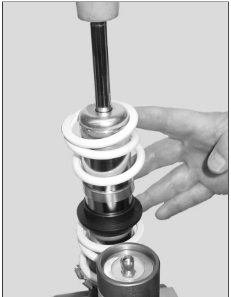
Fig. 6-- Install the spring separator, crossover ring and second spring. Refer to the diagram for the length and number of crossover that are used in your kit. There can be one or more. Also use the diagram to identify the spring.

NOTE: The kits vary in the parts that are used based on the rider weight, intended use, extended or stock arms, etc. As a result not all kits will have all of the same parts shown here. Besides different rate springs, the parts that vary will be the rings that fit inside the small springs. In some cases there may be none in the assembly, or as many as four. Refer to the diagram in the kit for which parts go where and which parts are included with your kit.