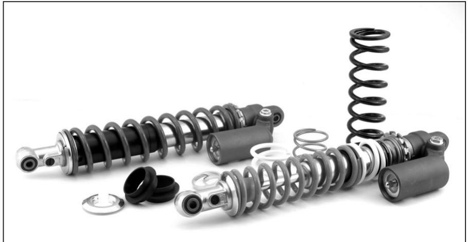
Fig. 1-- Works triple-rate springs are designed to fit your weight, riding type and arm configuration.

Each of the kits is based on the rider weight, intended use (trail, MX etc.) and for stock or extended arms. As a result the parts will vary from kit to kit. In the kit is a diagram of the spring set. It will tell you which parts are included in the kit and their location. It will describe the short springs so that they can be identified after the part number tags are removed. Refer to the diagram while you read this guide and begin the installation.