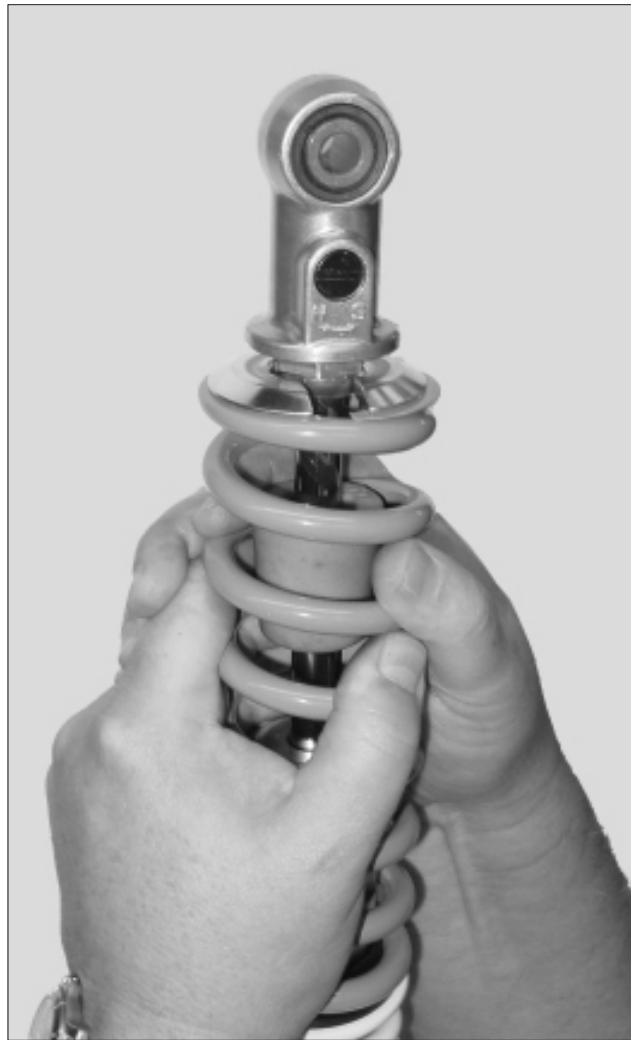
Fig. 8-- Depending on how stiff the spring is, it is possible to load the spring retainer with help from a friend. Otherwise, load the shock into the press.

11. Install the other spring separator and the main spring.