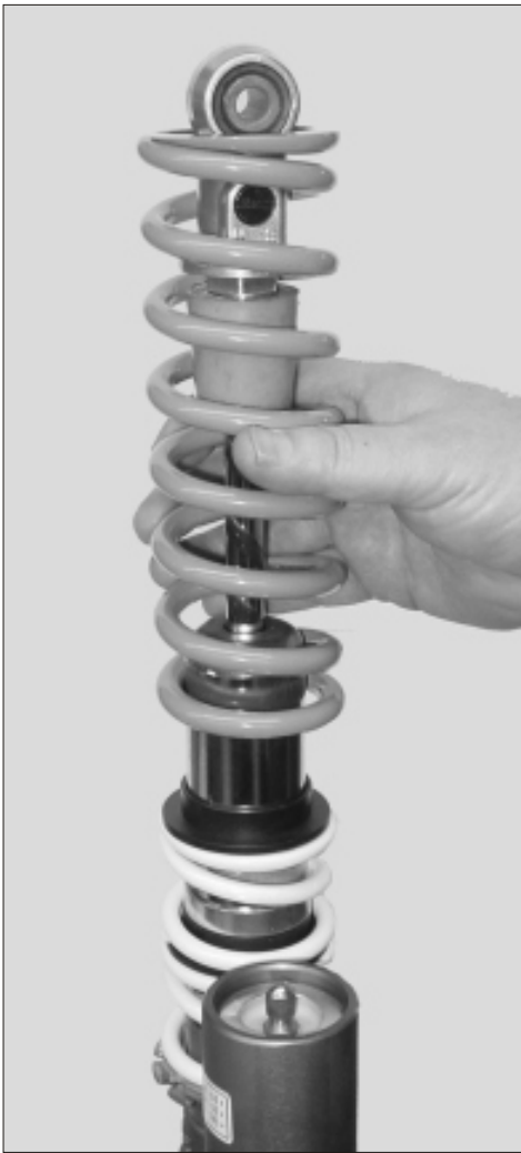
Fig. 7--Install the main spring last. Before you install the retainer, make sure that the spring pre-load collar is notched into place.