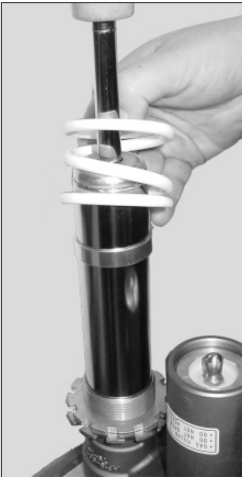
Fig. 5-- Refer to the diagram of the parts in the kit, as to whether or not you will install a ring here inside of the spring. Some kits will not have one here.