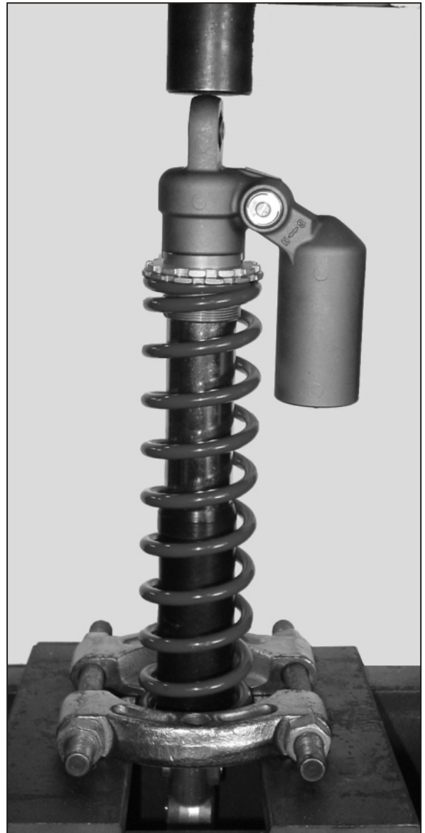
Fig. 3-- Run the ram down on the end of the body eye to push the shaft end eye through the split retainers, allowing the retainers to be removed.

6. Remove the metal retainer, plastic sleeve and spring from the shock. Break loose the pre-load nuts and unscrew them from the pre-load collar. They will need to be installed upside down to fit the spring set (Fig. 4).