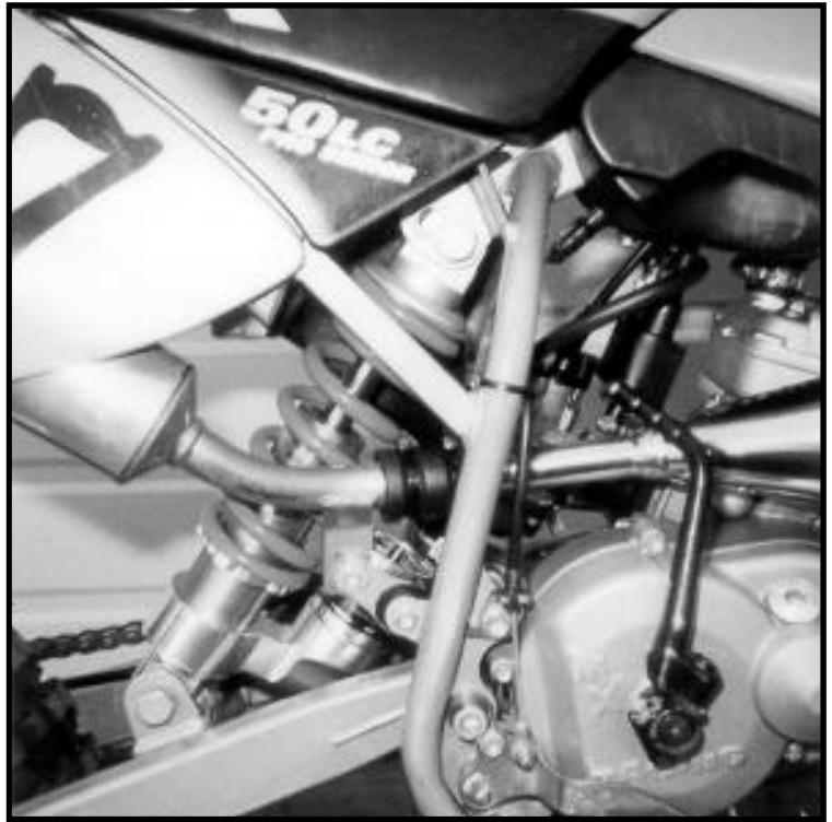
Fig. 1. Works' Pro Series Piggyback mounts with the reservoir down and toward the front of the bike. Make sure that the area above the reservoir is clear of lines, hoses, wires, etc. because the reservoir will move into this area as the shock compresses.

Because of the tight confines of the area left for the shock, the only way to mount the shock is with the body down and the reservoir towards the front inside the swing arm. (See Photo.) Make sure that wires, cables or vent hoses are routed away from the area above the reservoir. As the shock compresses and the swing arm moves up, the reservoir will move up into that space. The shock was designed around the stock exhaust pipe/expansion chamber, so make sure that if an aftermarket exhaust is used that it does not interfere with the shock. There should be nothing on the bike that will make contact with the spring, shock body, or reservoir at any time during its stroke. This is very important for the life of the seals and long service life between oil changes. Use a thread locking compound on the shock bolts when tightening them to the manufacturer's specifications.